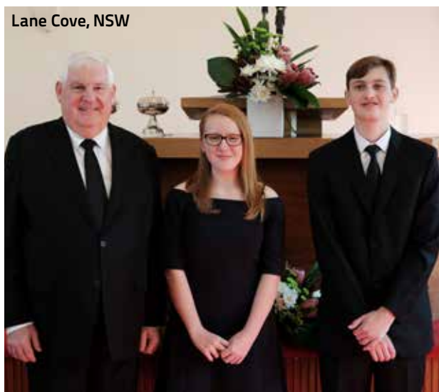
Lane Cove, NSW