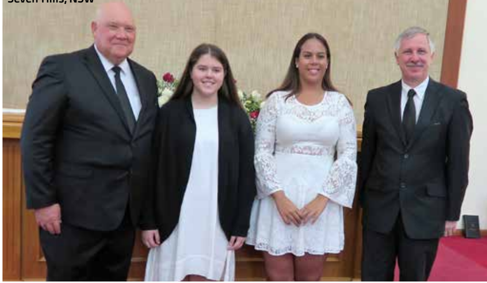
Seven Hills, NSW