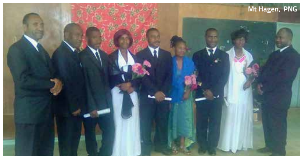
Mt Hagen, PNG