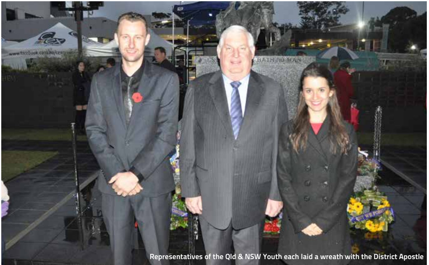
Representatives of the Qld & NSW Youth each laid a wreath with the District Apostle