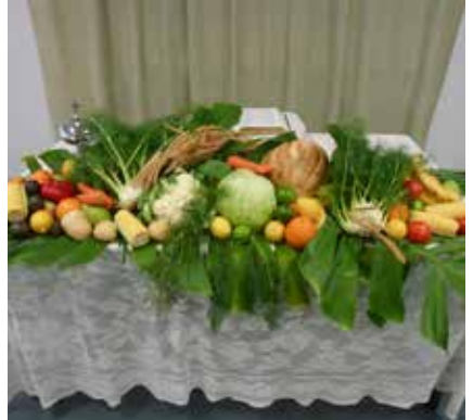
Coffs Harbour (NSW)