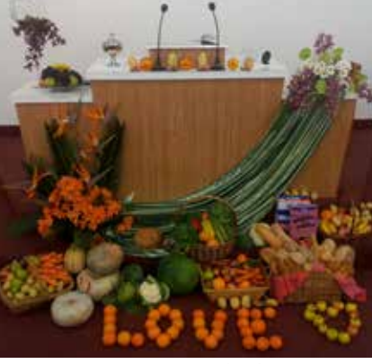
Ascot Park (SA)