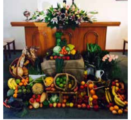
Beverly Hills (NSW)