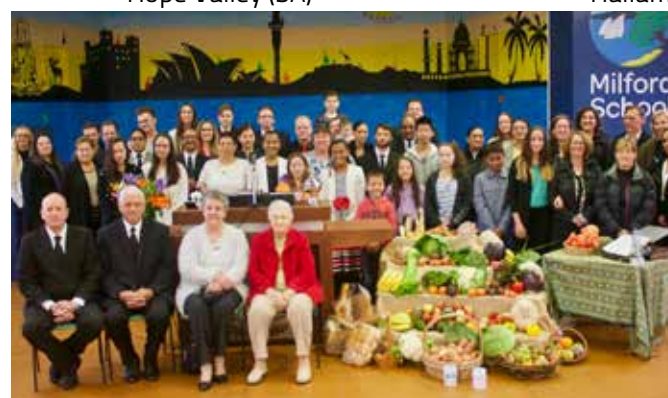
North Shore (NZ)