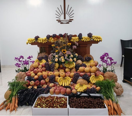
Chuncheon, South Korea