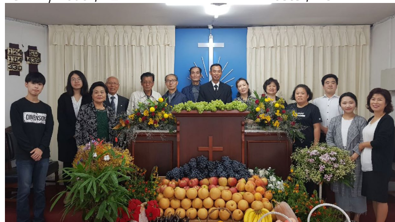
Jeonju, South Korea