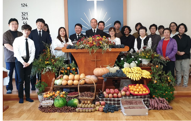
Jochiwon, South Korea