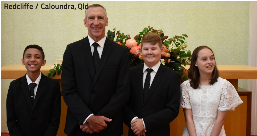
Redcliffe / Caloundra, Qld