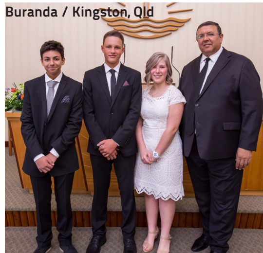
Buranda / Kingston, Qld