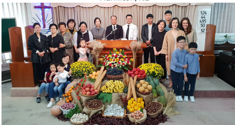
Ahnshan, South Korea