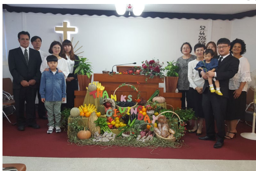
Busan, South Korea