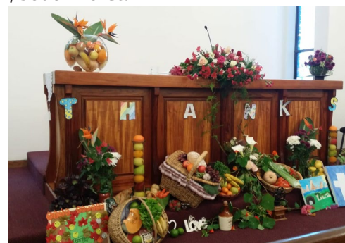
Hackham West, SA