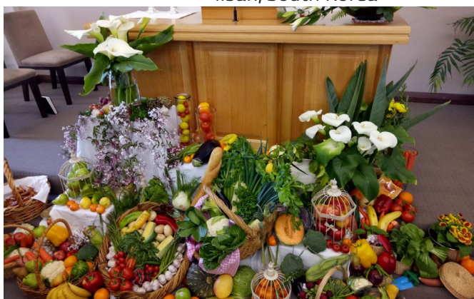
Box Hill, VIC