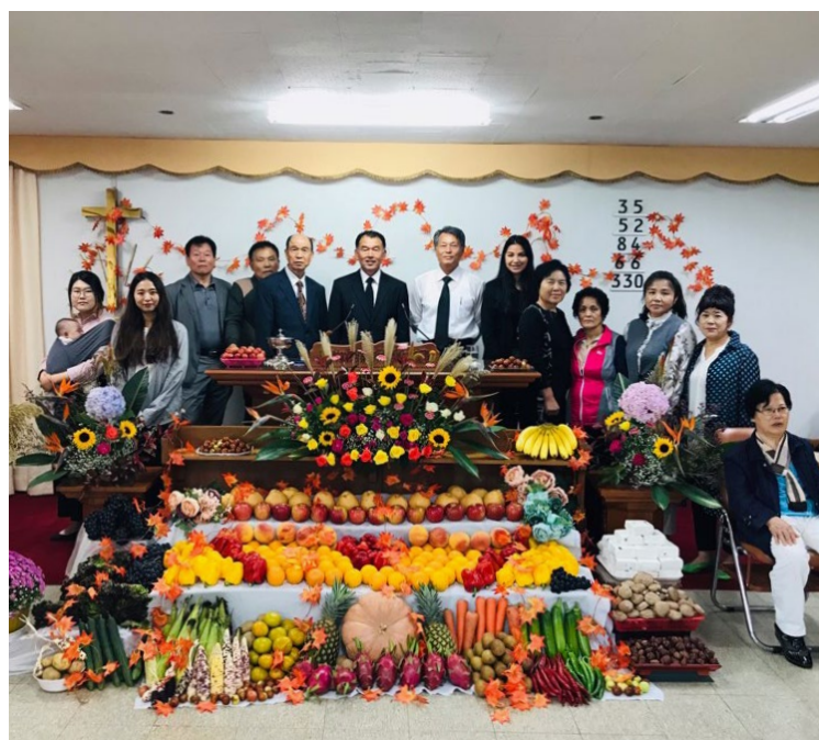
Gwangju, South Korea