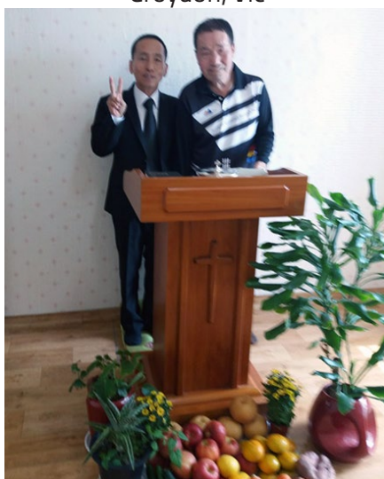
Daegu, South Korea