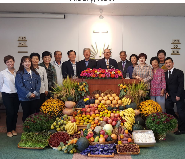
Namwon, South Korea