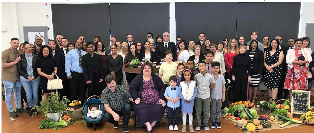
North Shore, NZ