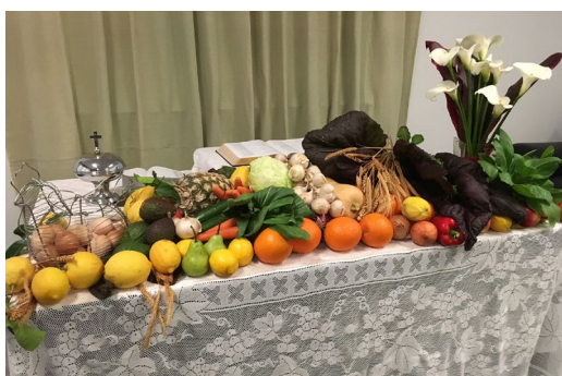
Coffs Harbour, NSW