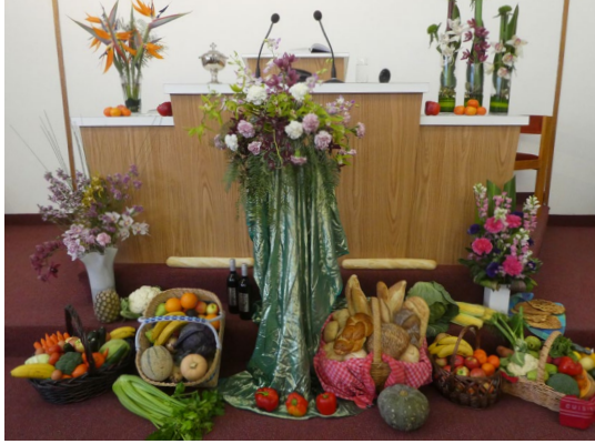
Ascot Park, SA