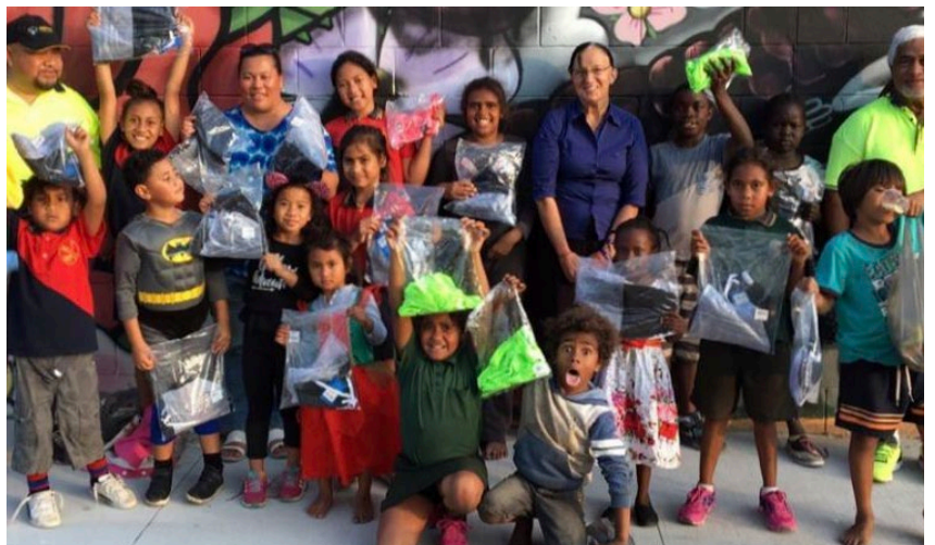
Flood victims gratefully receive donations from GIVIT

This disaster had an impact on our members just as it did all Australians, and many made the decision to contribute to this cause. The response to the appeal was overwhelming, and donations were received from all over Australia for the Townsville floods. This allowed NACare to donate an amount of $4000 to GIVIT, a charity nominated by the Government to handle this disaster.