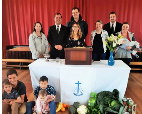
New Plymouth, NZ