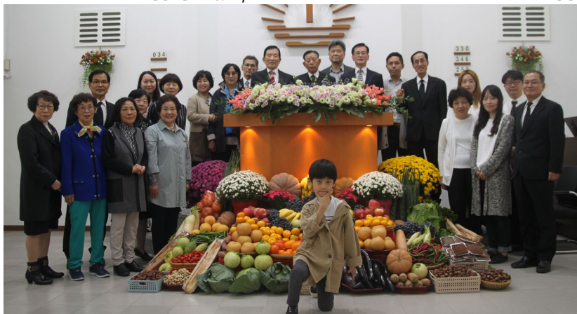
Ilsan, South Korea