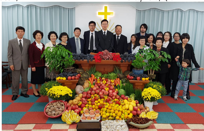
Daejeon, South Korea