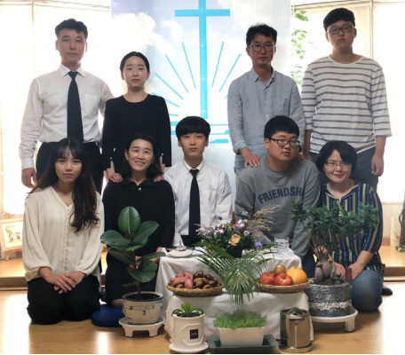
Pohang, South Korea