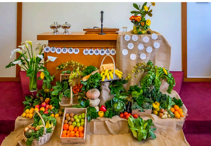
New Lynn, NZ