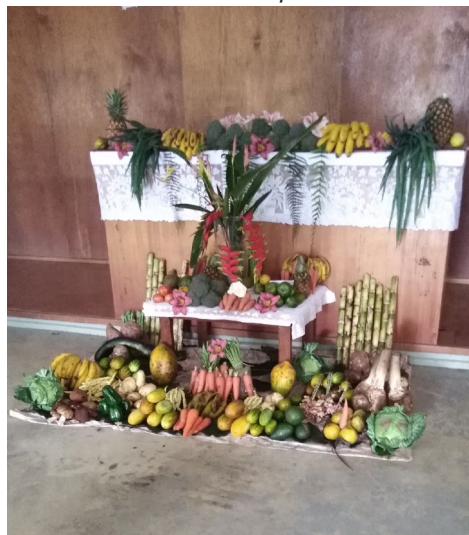
Mt Hagen, PNG