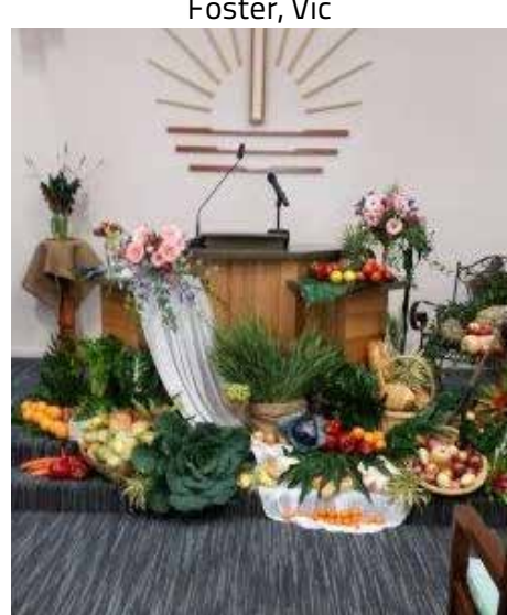
North Ipswich, Qld