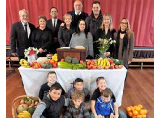
New Plymouth, NZ