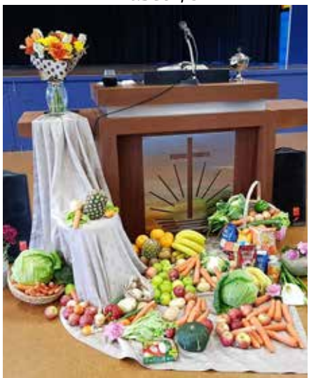
North Shore, NZ