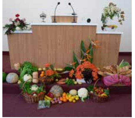
Ascot Park, SA