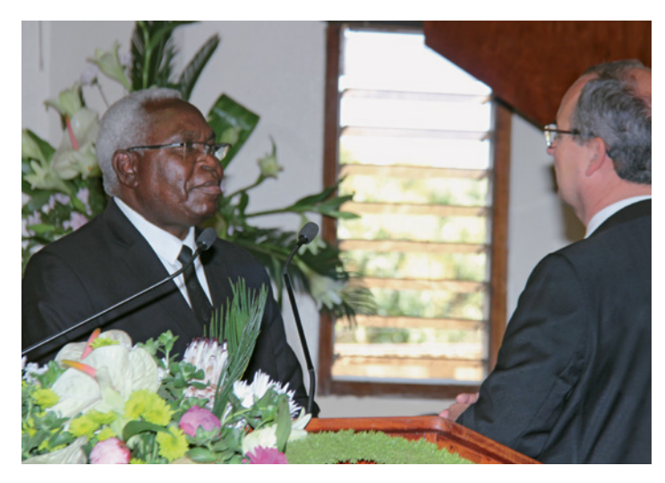
More than 4,500 believers gathered in the central church in Lusaka for the service