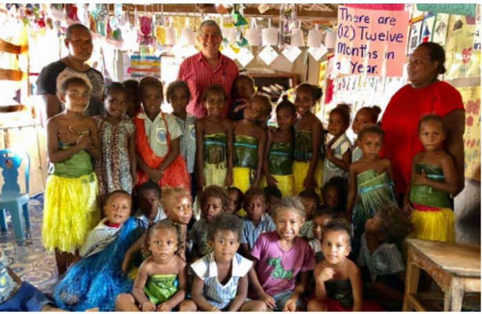
Preschool in Solomon Islands

These projects do not take the place of our primary mission, which is to offer assistance and financial support in the immediate aftermath of a natural disaster. This mission continues to be an important and ongoing focus for NACare, and we continue to raise awareness of – and provide a timely response to – these situations as they arise.